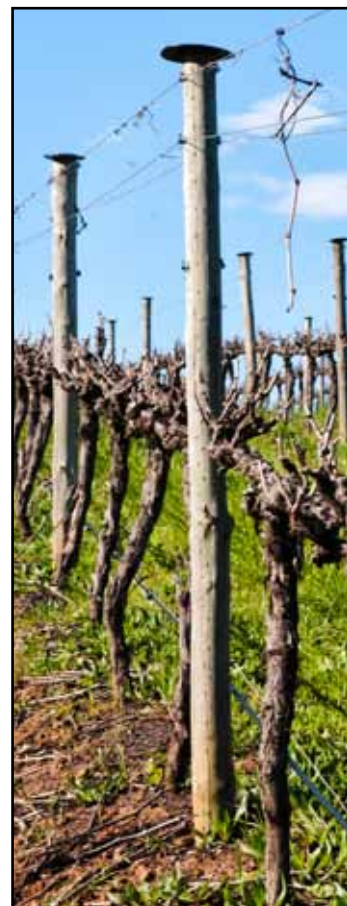
VSP Trellis System

Other vineyard tasks that have been performed in the vineyard during the last month was weed control between the rows with a slasher.