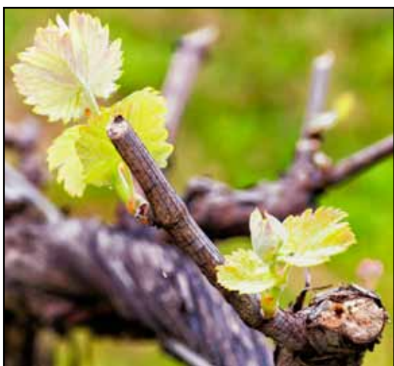
Shoots and leaves - 14th September

last growth cycle. Eventually the shoots sprout tiny leaves that can begin the process of photosynthesis, producing the energy to grow. After a few weeks of growth the vines