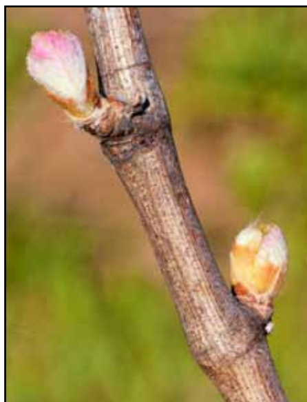
Buds break- 4th September

September, as the daily temperature slowly rises, the annual growth cycle of the vines begins with bud break and the first sign of green in the vineyard emerges. The energy to facilitate this growth comes from reserves of carbohydrate stored in roots and wood of the vine from the