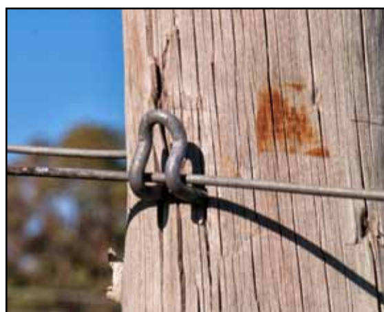
Catch wire hook