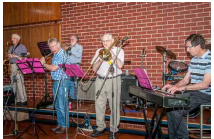
2016 BWBC Presentation Day